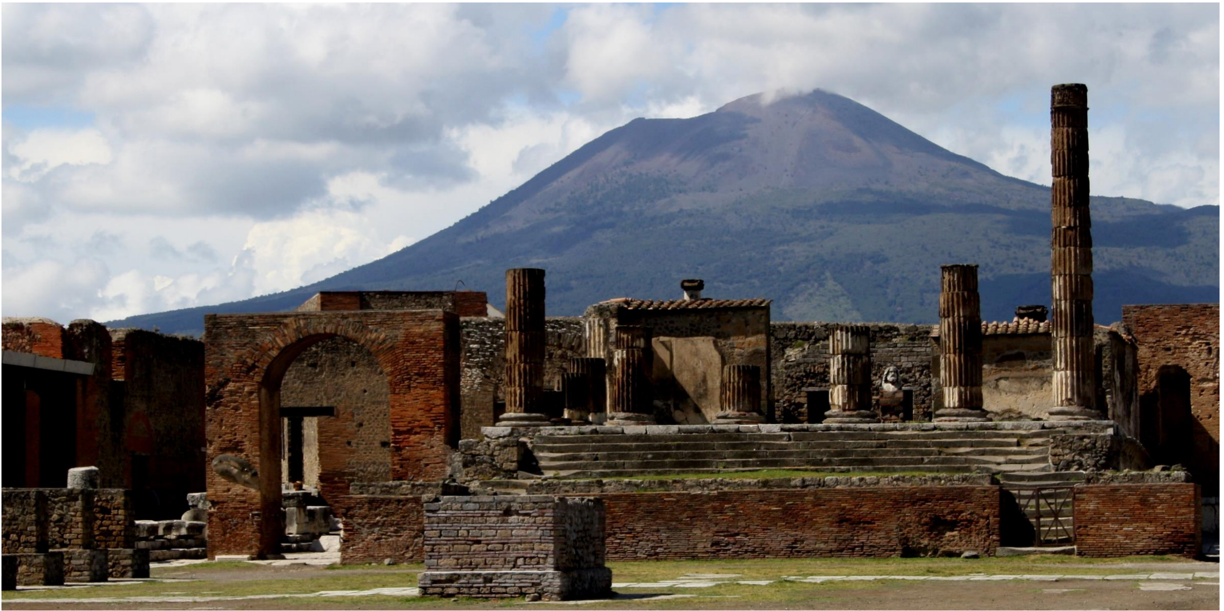
Pompei ruins with Vesuvio in background.